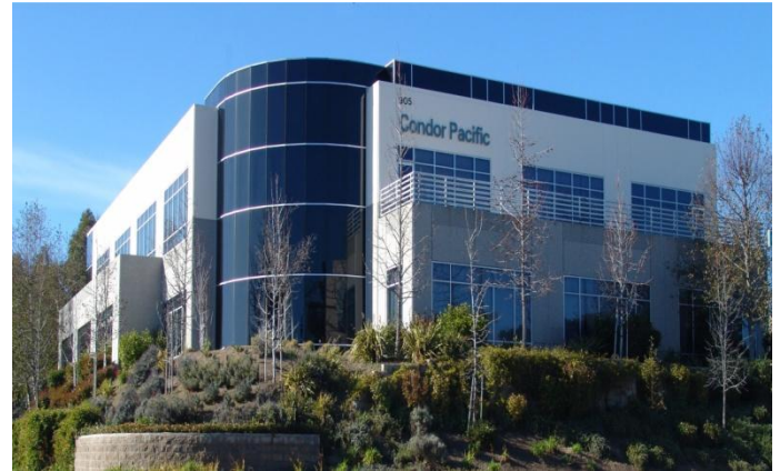
Modern facility in Newbury Park, CA

Critical processes including bearings are performed in CPI's certified Class 1000 clean room environment (Class 6 of ISO 14644-1)