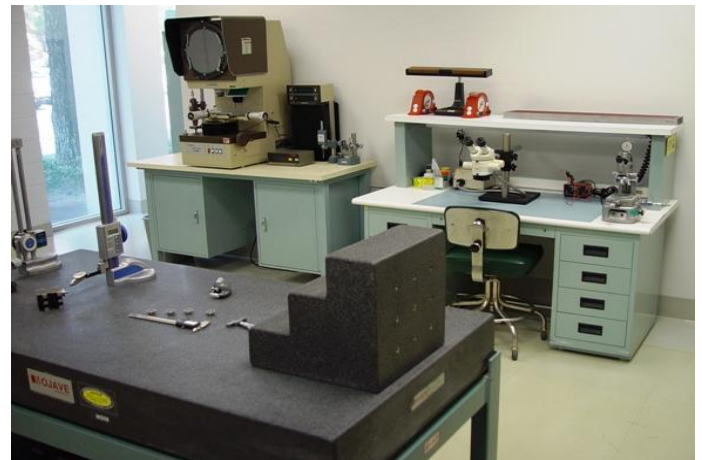
Fully equipped Incoming Inspection Department