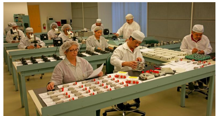
Class 10,000 clean room